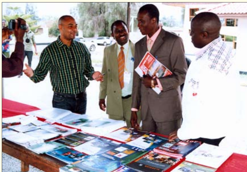
Guest of Honour touring the Book Exhibition

In recognition of the importance of information literacy to librarians and information workers in the country TLA organised the training to enable librarians to keep