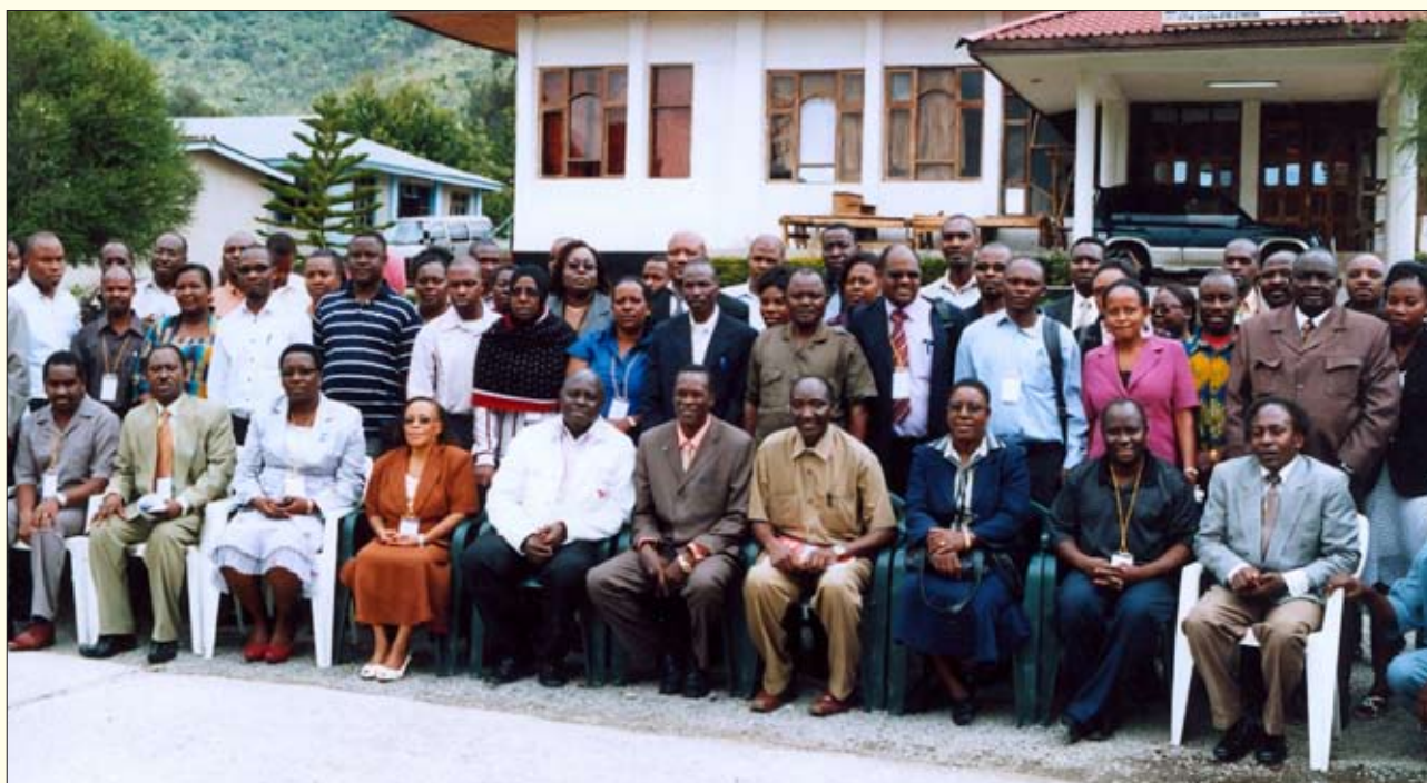
Group photo of participants and the Guest of Honour of TLA Mbeya AGM and Workshop.