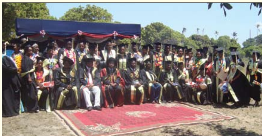
SLADS graduates group photo.

The Don noted at the 16 th School of Library, Archive and Documentation Studies (SLADS) Graduation ceremony, which was held at its Ukuni Campus – in Bagamoyo that, as the world is now moving towards an information society, library profession needs to re-evaluate itself and move in line with the new information needs.