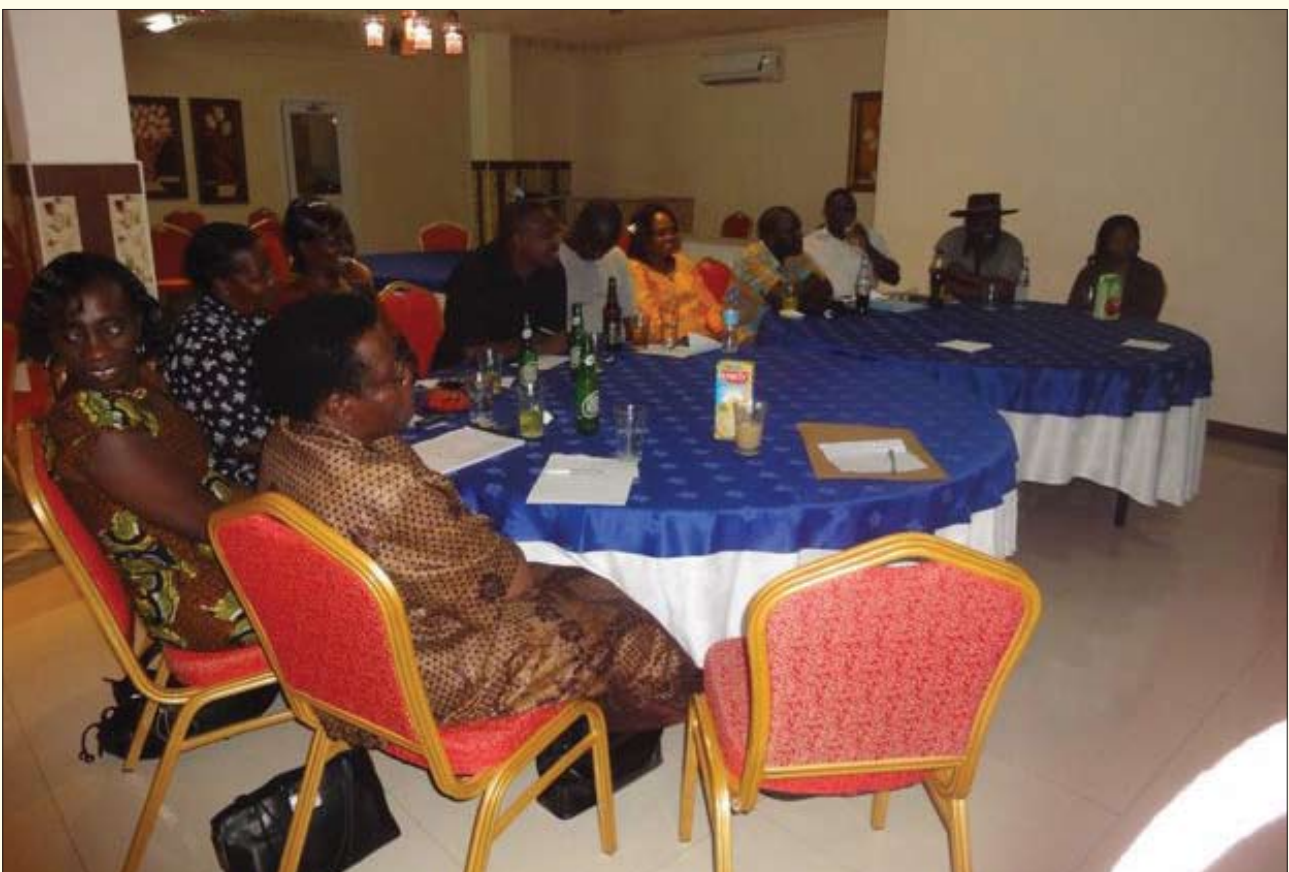
Some participants of the National Book Week in a group discussion.

This useful event which is organized under the auspices of National Book Council of Tanzania (BAMVITA) has been enjoying support from the regional body, East African Book Development Association (EABDA), whose support ends this year. With the funding challenges we have been facing and lack of support from the government part, especially the Ministry of Education and Vocation Training it is most likely that future festival need to be prepared with keen eyes and hearts to make them as successful.