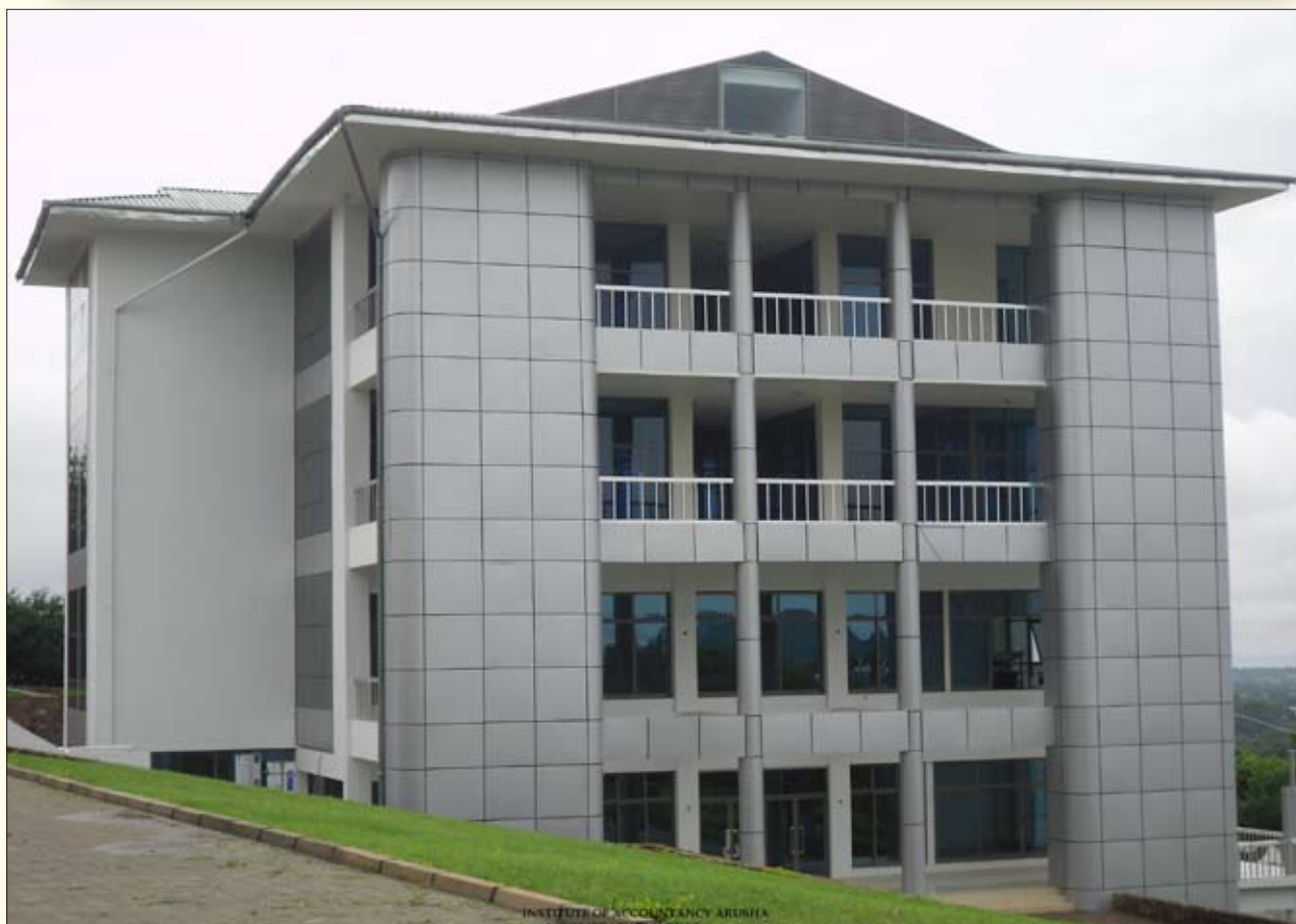
Institute of Accountancy Arusha New Library Building